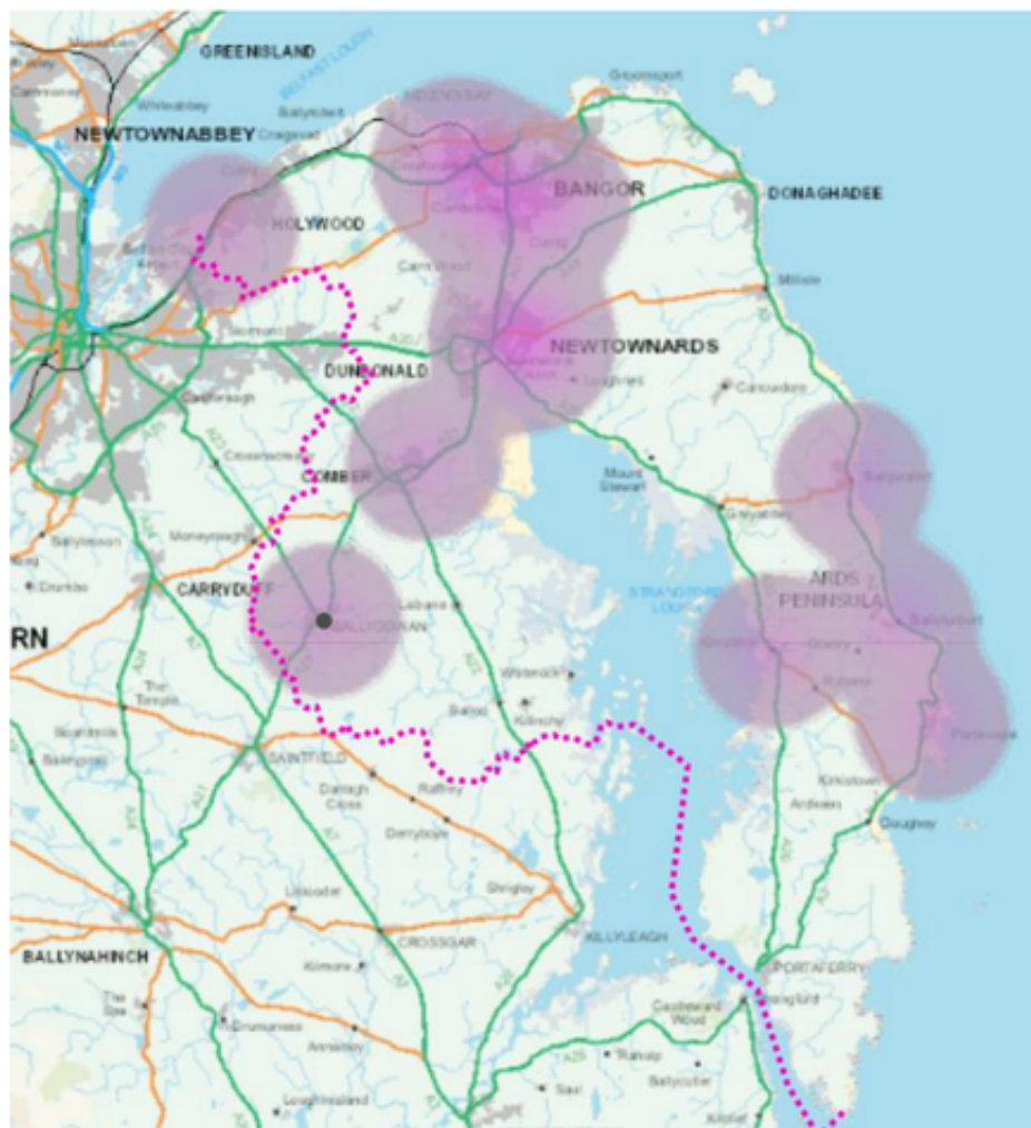
Distribution of NI Centenary grants within ANDBC.