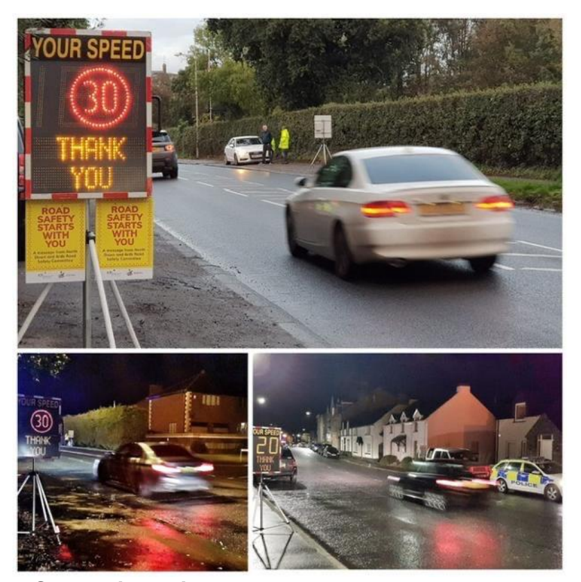
Photo – The SID Device being operated by the Ards and North Down Road Safety Committee.

The PSNI Road Safe Road Show was also cancelled due to Covid, and the funding was redeployed to the PSNI local road safety sessions in individual schools. Twelve sessions were held involving 700 pupils.