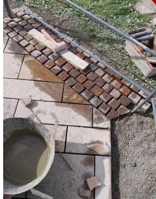
Intricate cobbling taking place in and around Market Square as the paving design begins to take shape

For further information visit: ardsandnorthdown.gov.uk/portaferrypublicrealm email: portaferrypr@northstone-ni.com or telephone: 07385 029 472 24 Hour Contact No: 028 9039 4419