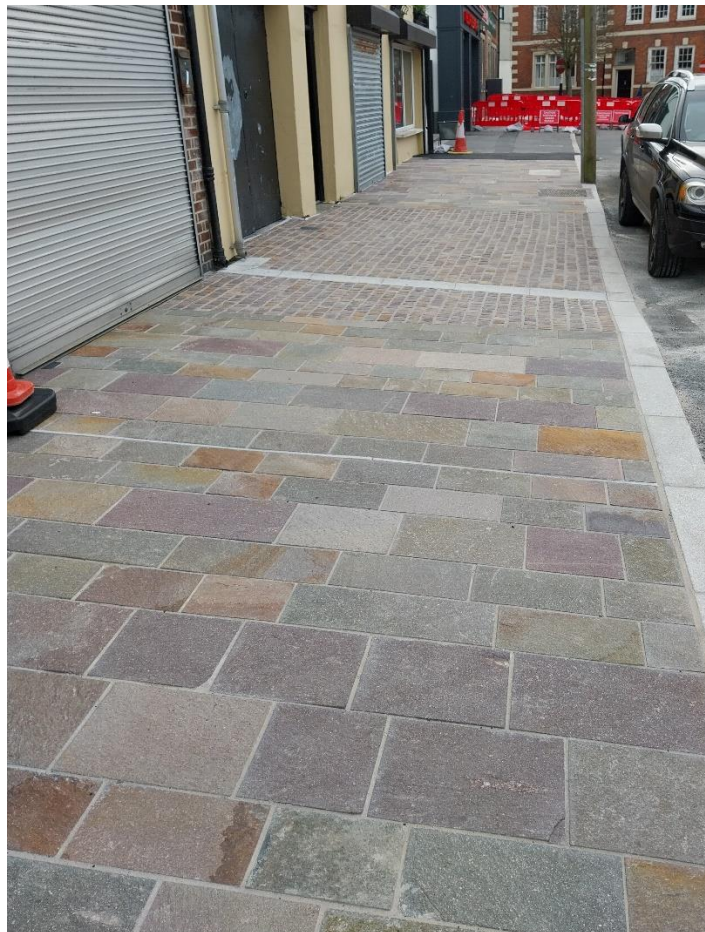
A section of completed footway at the north end of The Square

Welcome to the tenth newsletter for the Portaferry Public Realm Scheme. Newsletters will be issued monthly as works progress to keep residents and businesses updated on progress and future work schedules. You can register to receive these newsletters by emailing 'SUBSCRIBE' to portaferrypublicrealm@ardsandnorthdown.gov.uk . Alternatively, printed newsletters will be delivered to Exploris, Portaferry Library and Portaferry Post Office and can be picked up from there by anyone interested in the scheme who does not have access to email.