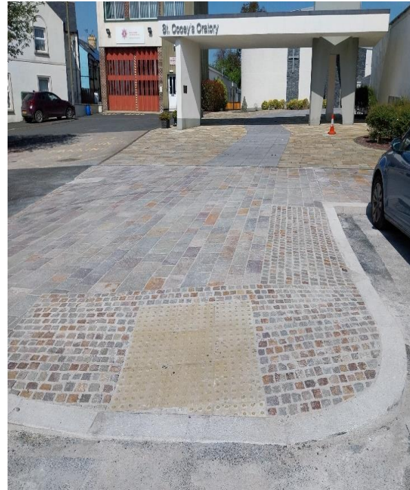
A close up from the Florentine design in Market Square and completed works at the crossing at St. Coey's Oratory

For further information visit: ardsandnorthdown.gov.uk/portaferrypublicrealm email: portaferrypr@northstone-ni.com or telephone: 07385 029 472 24 Hour Contact No: 028 9039 4419