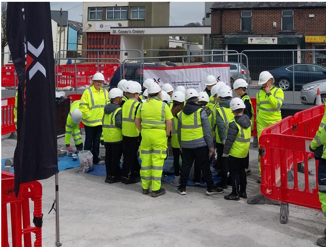
Year 6 pupils from St Mary's Primary School learning from the experts from Northstone Ltd. Perhaps some of these pupils will be involved in the next Portaferry Public Realm Scheme!

Welcome to the eleventh newsletter for the Portaferry Public Realm Scheme. Newsletters will be issued monthly as works progress to keep residents and businesses updated on progress and future work schedules. You can register to receive these newsletters by emailing 'SUBSCRIBE' to portaferrypublicrealm@ardsandnorthdown.gov.uk . Alternatively, printed newsletters will be delivered to Exploris, Portaferry Library and Portaferry Post Office and can be picked up from there by anyone interested in the scheme who does not have access to email.