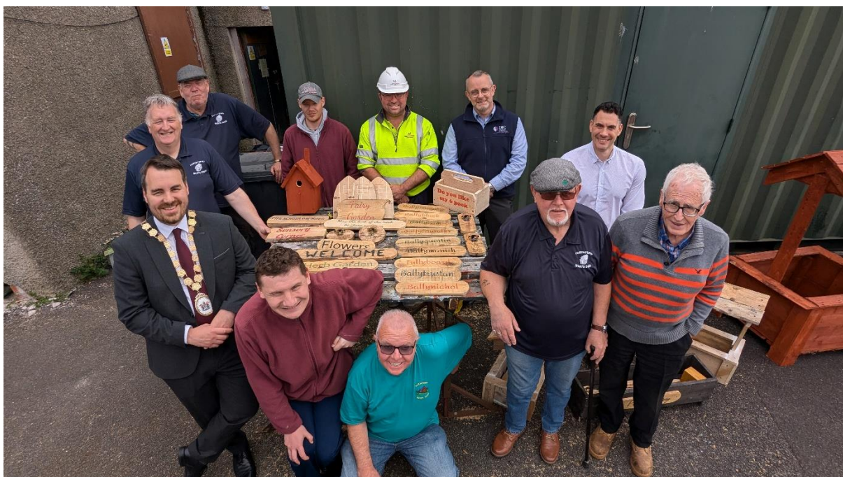
Portaferry Men's Shed members along with the Mayor and representatives of the Department for Communities, Northstone Ltd and Ards and North Down Borough Council pictured with some of the many items they have manufactured with the recycled wooden crates.

For further information visit: ardsandnorthdown.gov.uk/portaferrypublicrealm email: portaferrypr@northstone-ni.com or telephone: 07385 029 472 24 Hour Contact No: 028 9039 4419