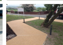
Resin bound gravel