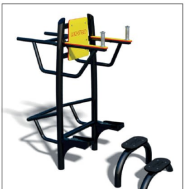
Step box multi gym