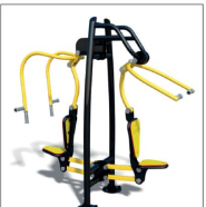
Chest Press Pull Down