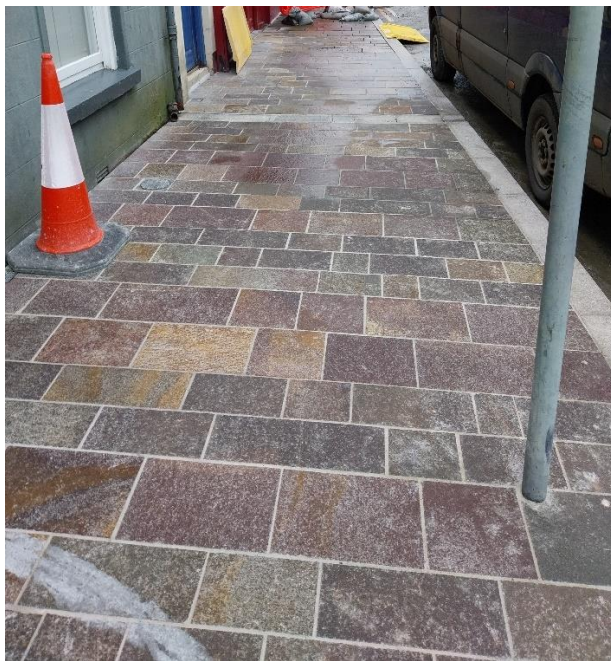
Works almost complete on the West footway

Welcome to the ninth newsletter for the Portaferry Public Realm Scheme. Newsletters will be issued monthly as works progress to keep residents and businesses updated on progress and future work schedules. You can register to receive these newsletters by emailing 'SUBSCRIBE' to portaferrypublicrealm@ardsandnorthdown.gov.uk . Alternatively, printed newsletters will be delivered to Exploris, Portaferry Library and Portaferry Post Office and can be picked up from there by anyone interested in the scheme who does not have access to email.