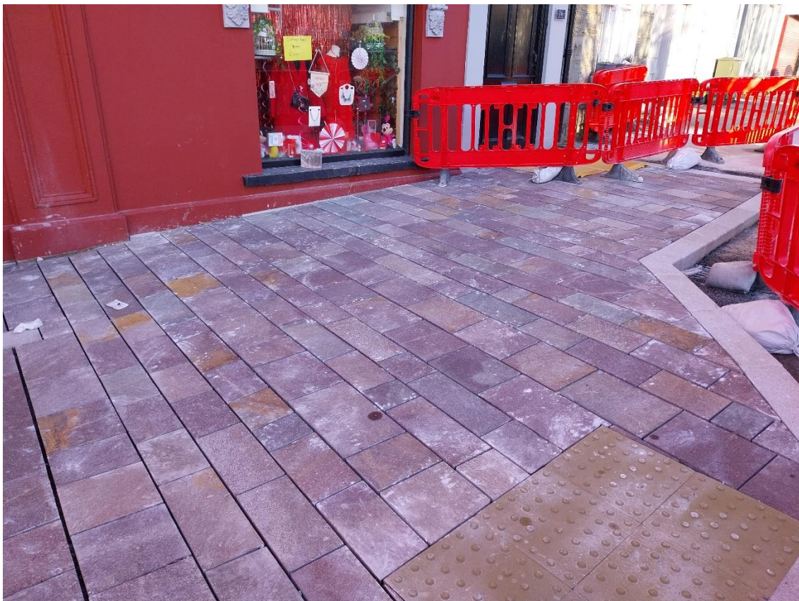
New paving works on the west side of The Square outside No.16

Newsletters will be issued monthly as works progress to keep residents and businesses updated on progress and future work schedules. You can register to receive these newsletters by emailing 'SUBSCRIBE' to portaferrypublicrealm@ardsandnorthdown.gov.uk . Alternatively, printed newsletters will be delivered to Exploris, Portaferry Library and Portaferry Post Office and can be picked up from there by anyone interested in the scheme who does not have access to email.