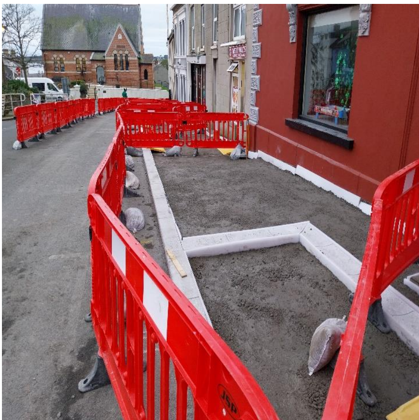
New granite kerbing installed to the side of Market Square, and concrete base laid in advance of the paving works which are due to start in February

Welcome to the seventh newsletter for the Portaferry Public Realm Scheme. Newsletters will be issued monthly as works progress to keep residents and businesses updated on progress and future work schedules. You can register to receive these newsletters by emailing 'SUBSCRIBE' to portaferrypublicrealm@ardsandnorthdown.gov.uk . Alternatively, printed newsletters will be delivered to Exploris, Portaferry Library and Portaferry Post Office and can be picked up from there by anyone interested in the scheme who does not have access to email.