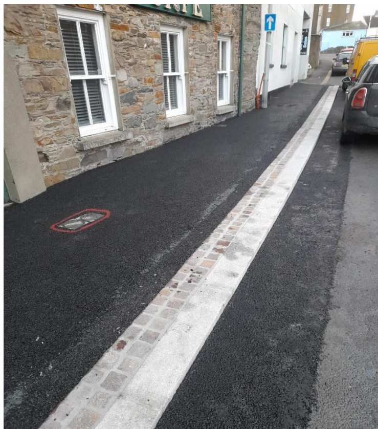
Works progressing on Castle Street with the base material and porphyry band laid

Welcome to the sixth newsletter for the Portaferry Public Realm Scheme. Newsletters will be issued fortnightly as works progress to keep residents and businesses updated on progress and future work schedules. You can register to receive these newsletters by emailing 'SUBSCRIBE' to portaferrypublicrealm@ardsandnorthdown.gov.uk . Alternatively, printed newsletters will be delivered to Exploris, Portaferry Library and Portaferry Post Office and can be picked up from there by anyone interested in the scheme who does not have access to email.