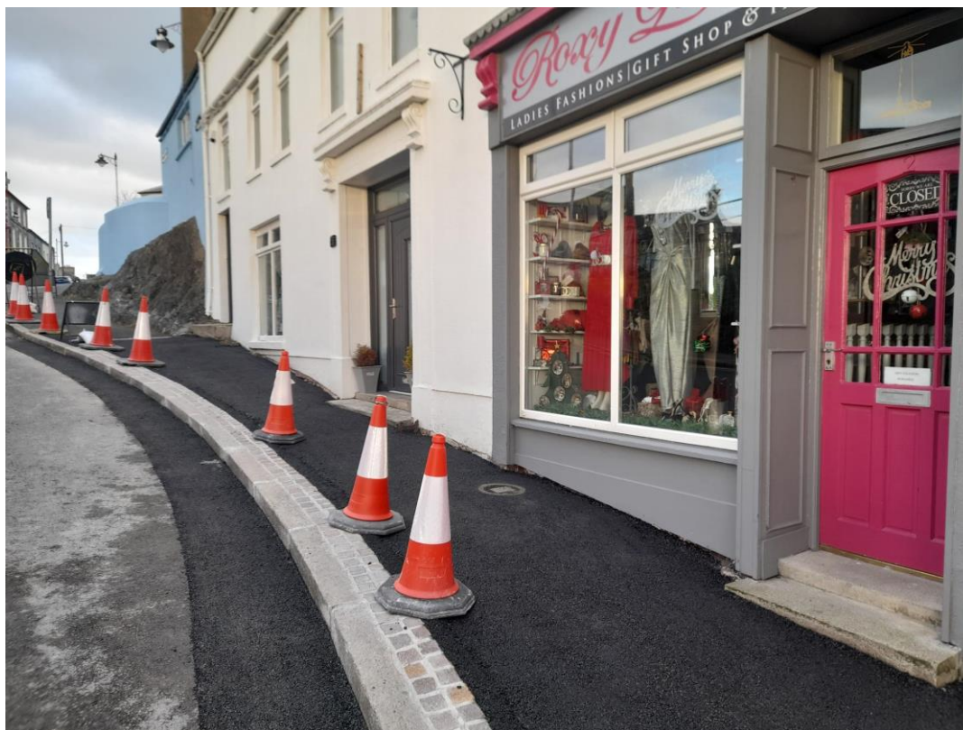
Works progressing on Ferry Street with the base material and porphyry band laid

Welcome to the fifth newsletter for the Portaferry Public Realm Scheme. Newsletters will be issued fortnightly as works progress to keep residents and businesses updated on progress and future work schedules. You can register to receive these newsletters by emailing 'SUBSCRIBE' to portaferrypublicrealm@ardsandnorthdown.gov.uk . Alternatively, printed newsletters will be delivered to Exploris and can be picked up from there by anyone interested in the scheme who does not have access to email.