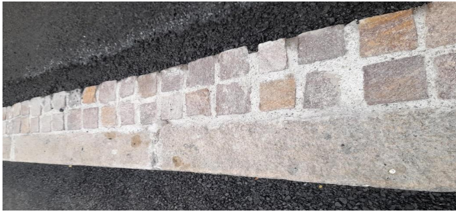
Close up of a section of the porphyry band in the pavement on Ferry Street