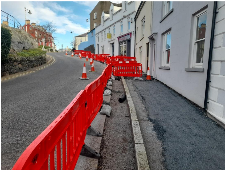
The re-laid pavement at Ferry Street awaiting the Italian Porphyry stone band placement to be installed on the left section of the above pavement image

Welcome to the fourth newsletter for the Portaferry Public Realm Scheme. Newsletters will be issued fortnightly as works progress to keep residents and businesses updated on progress and future work schedules. You can register to receive these newsletters by emailing 'SUBSCRIBE' to portaferrypublicrealm@ardsandnorthdown.gov.uk . Alternatively, printed newsletters will be delivered to Exploris and can be picked up from there by anyone interested in the scheme who does not have access to email.